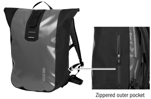
Zippered outer pocket